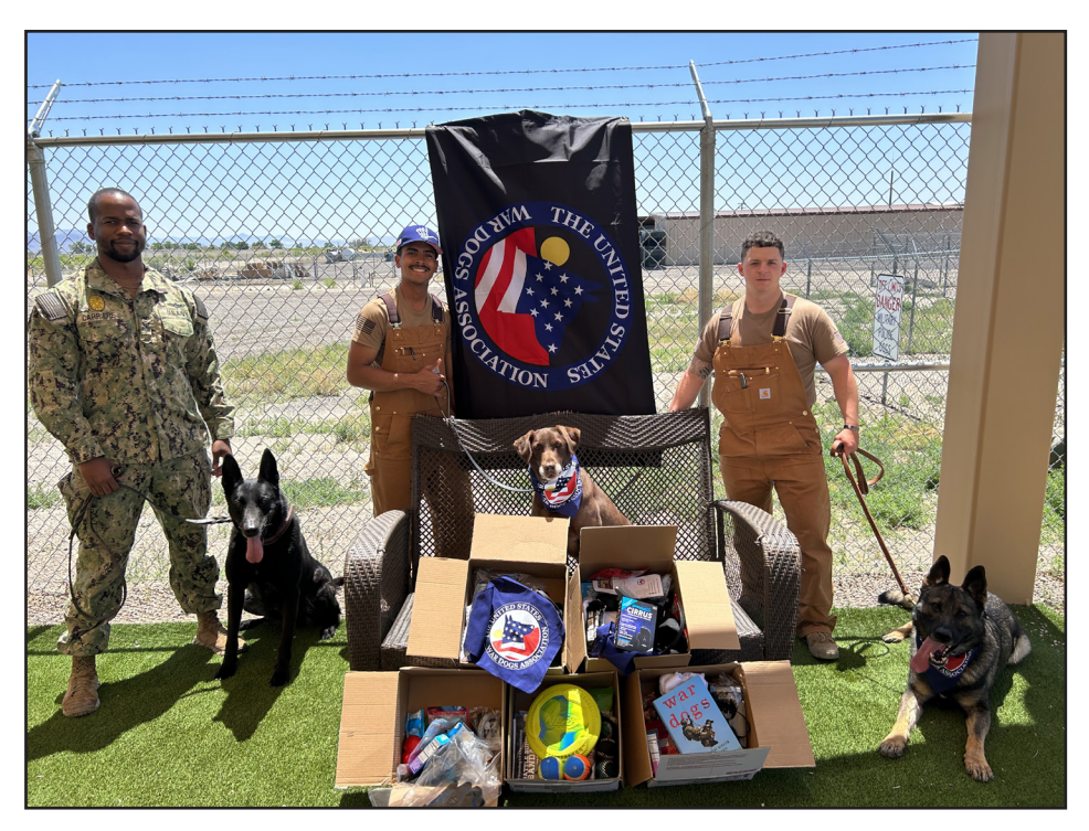
Active-duty military canines and their handlers are shown with care packages made possible last year by Friends of Coffey Health System. In addition to the care packages, our volunteers collect cards and letters from school children throughout the area. The 2023 care package project is underway now. To contribute, stop by the hospital gift shop.